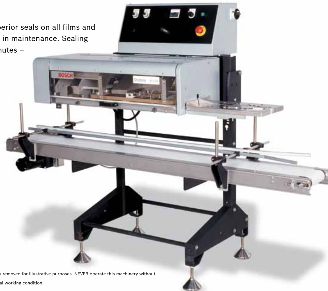
The machinery shown herein may have had guards removed for illustrative purposes. NEVER operate this machinery without all guards in place and all safety features in original working condition.

The B-500 is available with a wide variety of options including coders (ink and emboss), bag trimmers, stainless steel construction, counters and integrated conveyors. The B-500 is also available in horizontal or vertical versions.