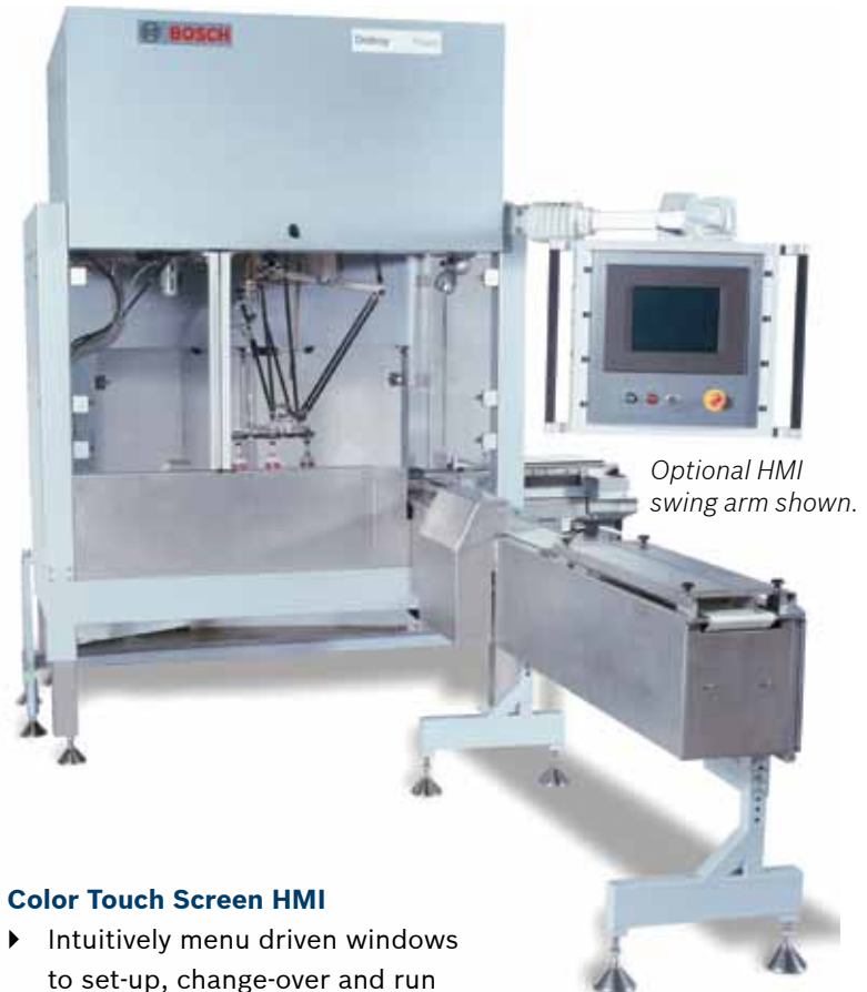
Optional HMI swing arm shown.